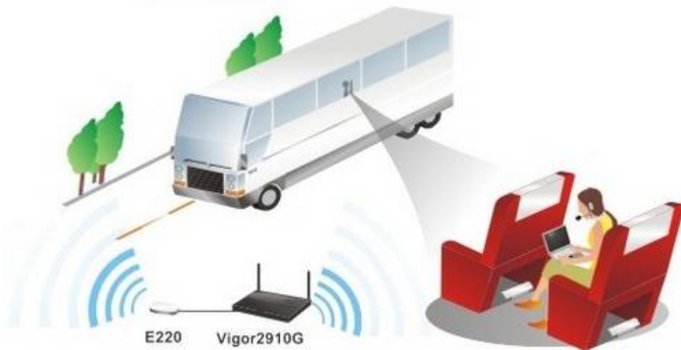
Example Use : Installation in a mobile café or moving bus